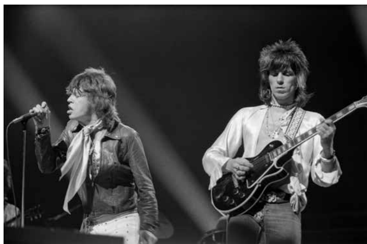
Mick Jagger and Keith Richards, Charlotte, 1972.