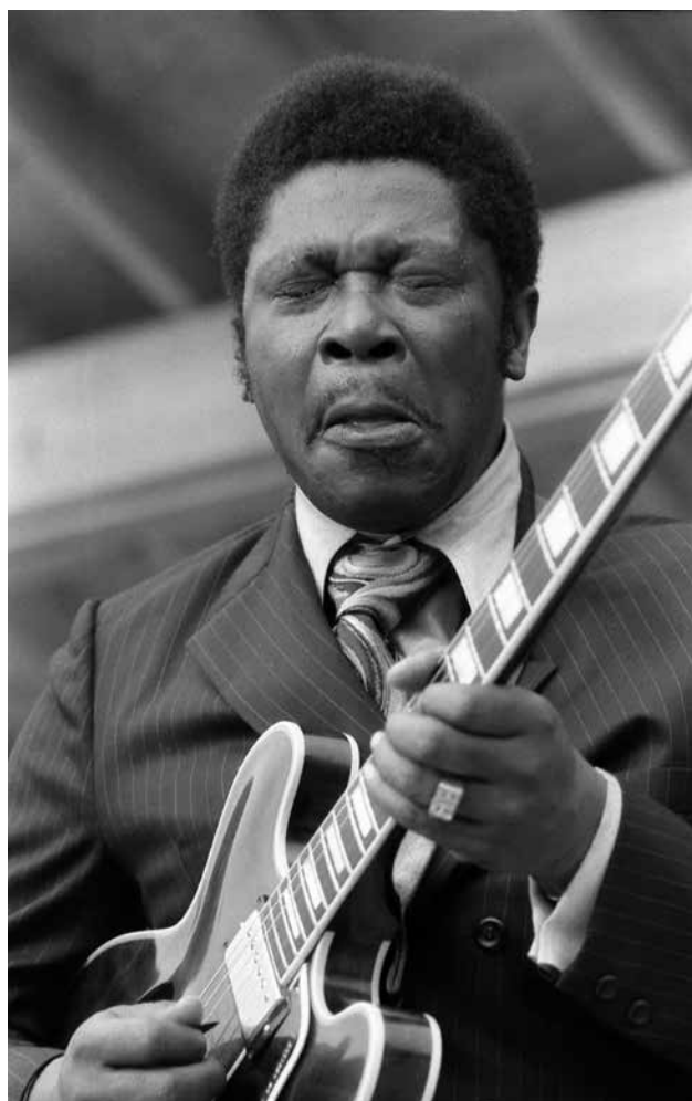
B.B. King - Atlanta, June 1971.